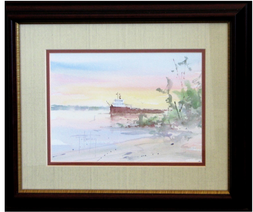
Below rt., original transparent watercolor by Toni Leni , Visit to the Island