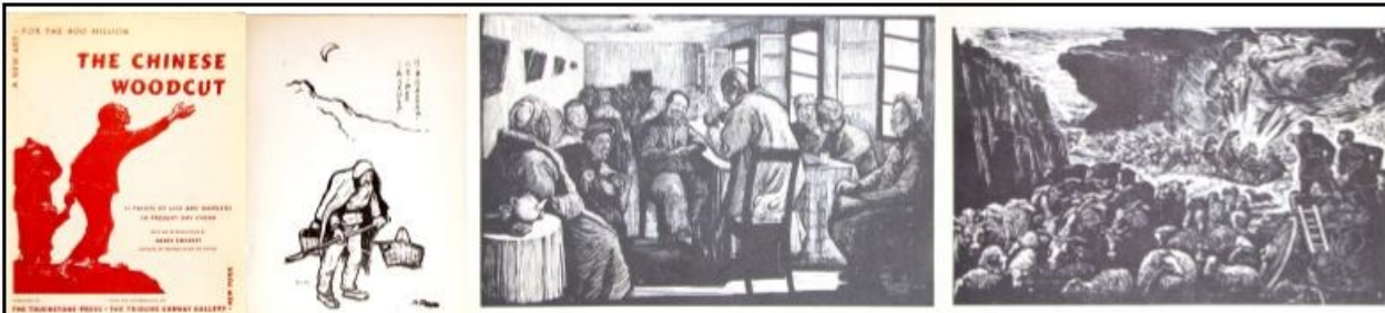
Set of 11 vintage Chinese woodcuts ready for matting and framing—cover and three of the wood cuts are at left.