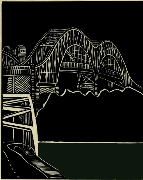
THE INTERNATIONAL BRIDGE SAULT STE. MARIE, MICHIGAN AND CANADA