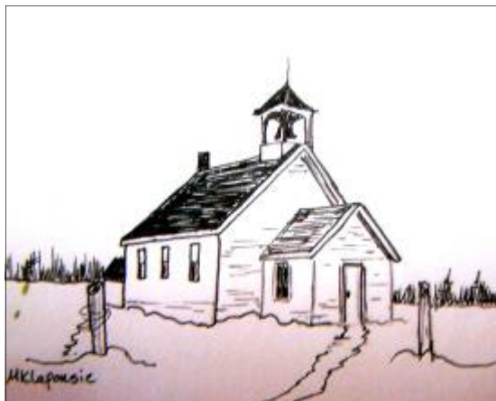
Holland School