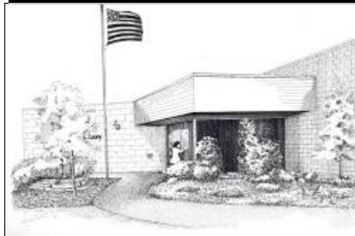
BAYLISS LIBRARY — 541 Library Drive (906) 632-9331. www.baylisslibrary.org .

Sunday 28— INTERNATIONAL IDOL CONTEST. See June 7.